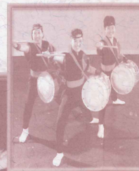
San Jose Taiko