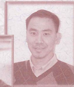
Donovan Le Lecture Series III