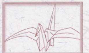
Thousand Cranes of Peace