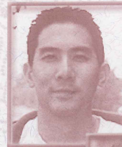
Donald Young Lecture Series I